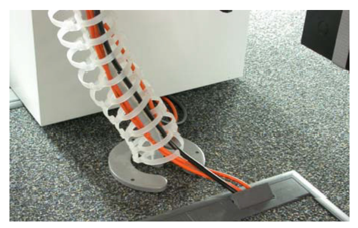
Cable management from each floor box to desk