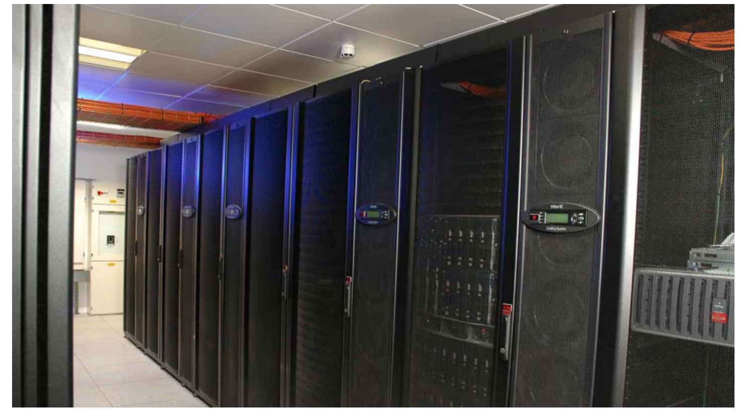
The completed cold aisle with just some of the shielded Net10G LSZH data cable in tray overhead