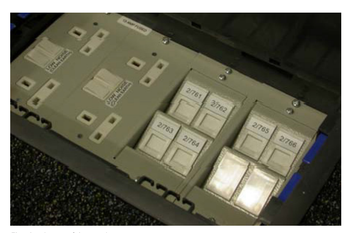
Floor box in one of the meeting rooms