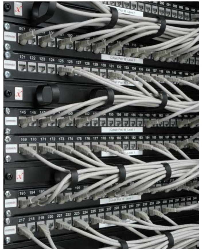
Net10G patch panels and cable management