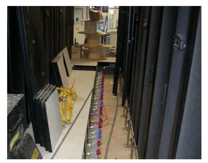
Data centre nearing completion before the servers are moved in

Shaun continued, 'The data centre will house approximately 330 servers eventually. This is guite a considerable power hungry resource so the energy requirements were an important part of the design, along with cooling. Scottish and Southern Energy supplied a 11kV connection into a National Grid Substation and 11kV/LV infrastructure throughout the business park but we knew we would need a reliable backup. The generators housed a few meters from the main building will give us that resilience. Keysource were contracted to design a contained hot aisle configuration. This gives us no recirculation or short circuiting of cooling air within the data centre. This maintains inlet air temperatures within acceptable limits and maximises return air temperatures, ensuring free cooling potential is exploited. With the power, gas fire sup-pression and other systems the investment is major; we knew we needed a network cabling system that would guarantee us bandwidth for at least the next 10 years. We chose Connectix Net10G because they are a UK manufacturer, the support was excellent and 10G should see us through the 25 year lease of the building. The extra investment now will be saved several times over as we are confident of avoiding any upgrade of the cabling system.'