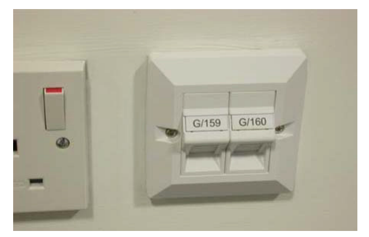
Angled wall outlets with Traffolyte labelling

Shaun continued, 'The data centre will house approximately 330 servers eventually. This is guite a considerable power hungry resource so the energy requirements were an important part of the design, along with cooling. Scottish and Southern Energy supplied a 11kV connection into a National Grid Substation and 11kV/LV infrastructure throughout the business park but we knew we would need a reliable backup. The generators housed a few meters from the main building will give us that resilience. Keysource were contracted to design a contained hot aisle configuration. This gives us no recirculation or short circuiting of cooling air within the data centre. This maintains inlet air temperatures within acceptable limits and maximises return air temperatures, ensuring free cooling potential is exploited. With the power, gas fire sup-pression and other systems the investment is major; we knew we needed a network cabling system that would guarantee us bandwidth for at least the next 10 years. We chose Connectix Net10G because they are a UK manufacturer, the support was excellent and 10G should see us through the 25 year lease of the building. The extra investment now will be saved several times over as we are confident of avoiding any upgrade of the cabling system.'